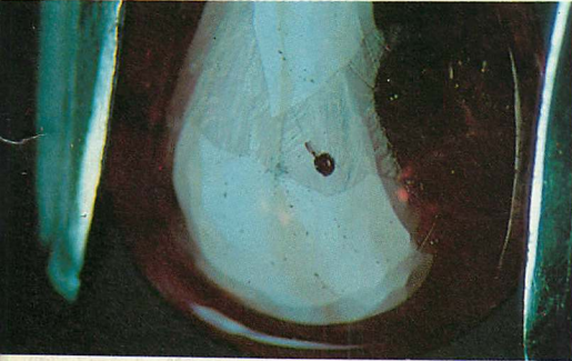
The large repaired area is exposed under oblique lighting, 23X (above), 40X (below)