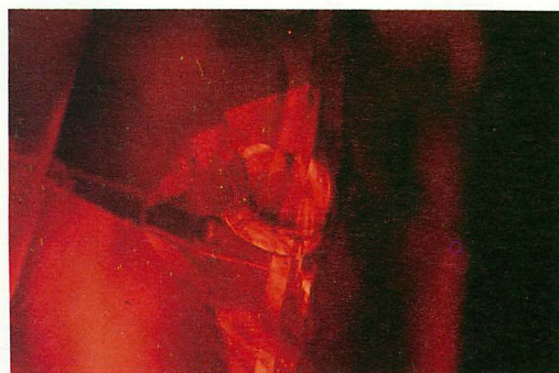
Thai ruby: magnified view (46 times left and 60 times right) of a surface pit which has been repaired by filling it with a glassy material. Note the large gas bubble in the filling material. The discovery was made by Suree Charoensrihanakul.