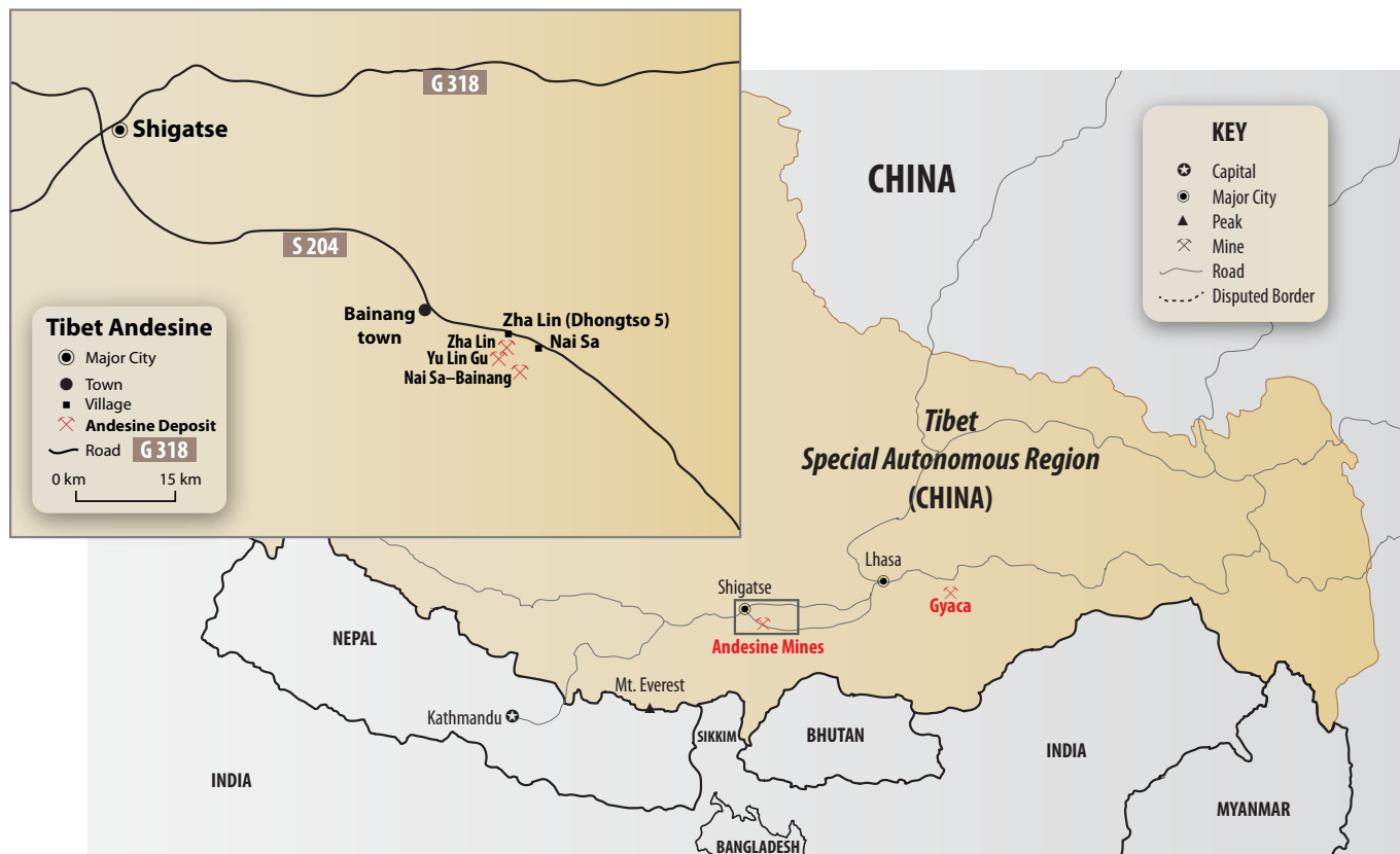
Figure 2. Map of Tibet showing the location of the Nai Sa-Bainang/Zha Lin/Yu Lin Gu andesine mines southeast of Shigatse, along with the Gyaca locality visited by Adolf Peretti in 2009. Map: R.W. Hughes; inset map after Abduriyim et al., 2011