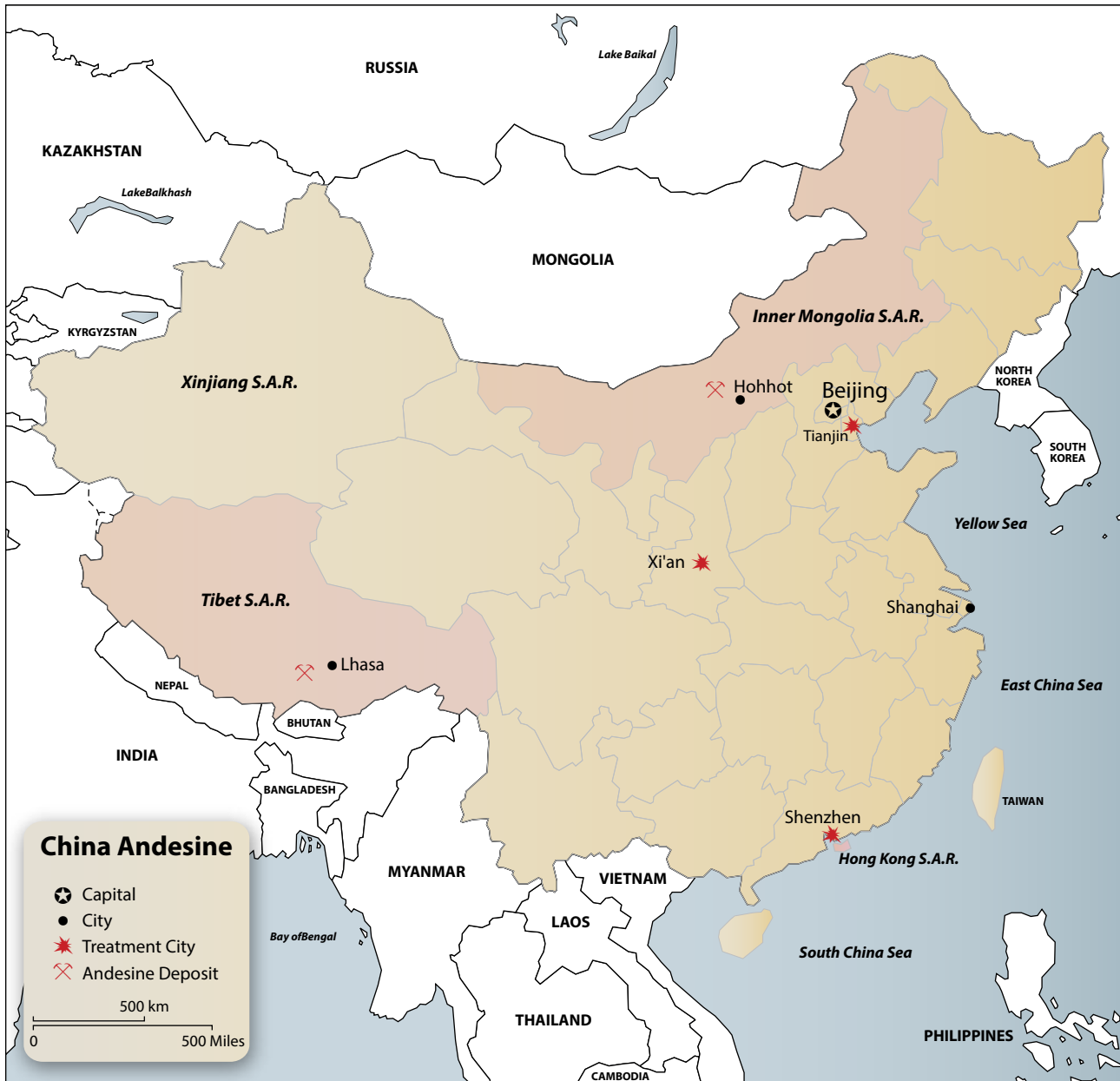
Figure 1. Map of China showing the location of the andesine mines in Tibet and Inner Mongolia, along with the locations of the major treatment centers. Map: R.W. Hughes